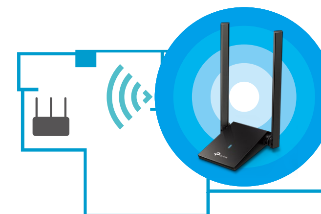
Archer TX20U Plus