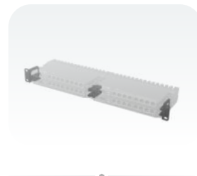
Rackmount kit K-79