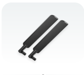
HGO indoor antenna kit