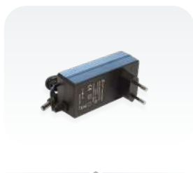
24 V 1.5 A power adapter