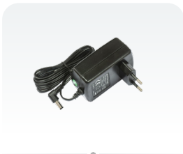
24 V 1.2 A power adapter