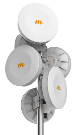
B5: 6 Dish Collocation