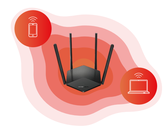
MR60X with Beamforming

Four powerful high-gain antennas armed with advanced wireless technology provide strong signals throughout your home. Beamforming detects your connected devices and concentrates wireless signal strength towards them, making your connections more stable.