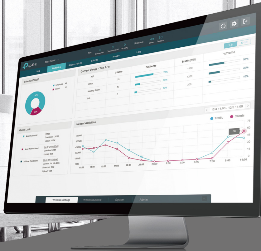
Omada Software Controller

EAP115/EAP110/EAP110-Outdoor/EAP115-Wall/EAP225-Wall