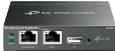
Omada Cloud Controller—OC200 (Built in Software Controller)