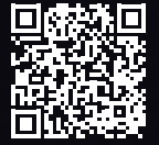
RUT260 360° VIEW

// RUT260 is a Teltonika Networks LTE Cat 6 cellular router with WAN failover. Balancing the key features of the RUT240 and RUT360, this cellular router is powerful, lightweight, and supports a wide variety of industrial protocols, including MQTT, SNMP, Modbus, and more.